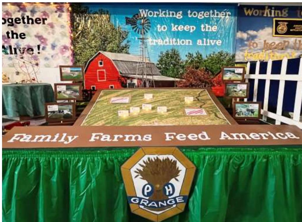
Above is the 2022 exhibit that salutes the Century and Bicentennial Farms in Perry and Juniata Counties where the same family has owned and farmed the land for 100 or 200 years. The exhibit earned a first place at Perry County Fair and second place at Juniata County Fair.